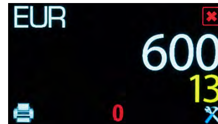
Large font display mode