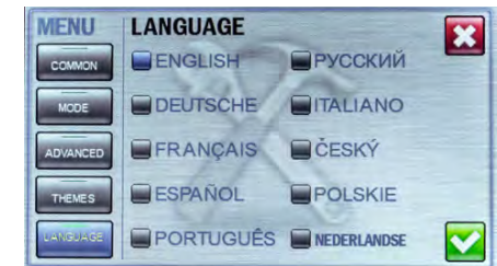
Choice of language