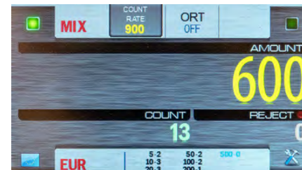
Wide screen display mode